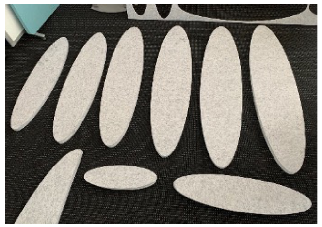
2. Take the longest pieces (central panels) and lay them out side by side. Remove the slot holders as pictured.

1. Pop the components out of the panel and sort into pairs. Lay out the pairs from largest to smallest.